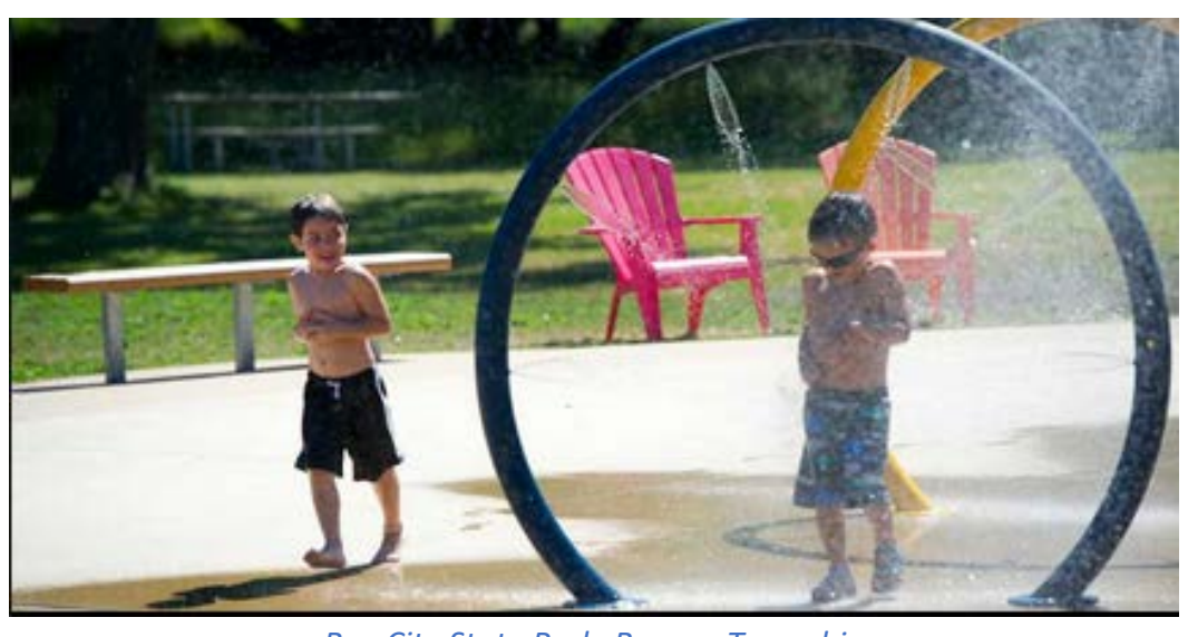
Bay City State Park, Bangor Township

Infants and children who drink water containing lead could experience delays in their physical or mental development. Children could show slight deficits in attention span and learning abilities. Adults who drink this water over many years could develop kidney problems or high blood pressure.